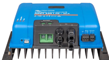
SmartSolar Charge Controller MPPT 250/70-MC4 without display