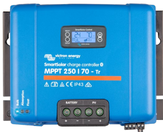
SmartSolar Charge Controller MPPT 250/70-Tr with optional pluggable display